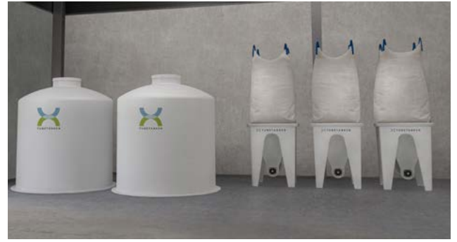
Hoppers can also be used in a fodder central.