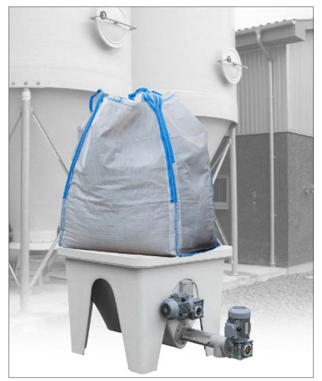
Hopper with mounted mixer and flexible screw conveyor.